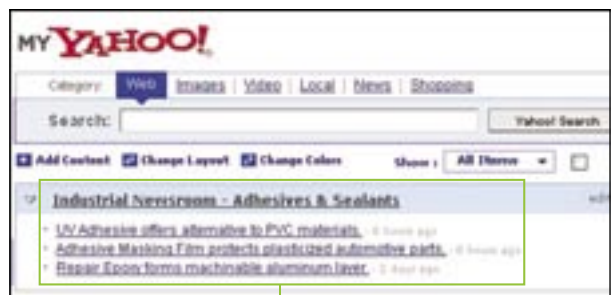
Industrial news sent with RSS

Your message reaches subscribers to RSS news feeds for your industrial product category. Really Simple Syndication (RSS) is a technology that distributes news to millions of Internet users on a regular basis – through sites that aggregate a variety of news, on corporate intranets, and to individuals using RSS readers on their desktops.