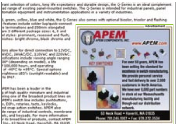
Promote your brand alongside your product news

If your company makes news available on ThomasNet Industrial News, you can enhance your presence on the site by including a display ad in the context of news articles about your company.