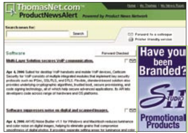
Sponsor e-mail newsletters

Your message is delivered into the in-boxes of decision-makers – daily, twice a week, or weekly. Since these product news e-mails are received by subscribers who ask for them, they reach a highly qualified and interested audience.